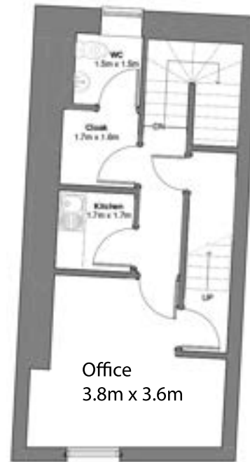
SF plan 1 : 50